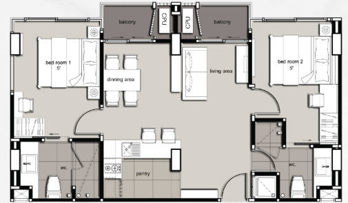
Type B2 2 Bedroom: 64 sq.m.