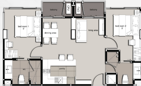
Type B1 2 Bedroom: 64 sq.m.