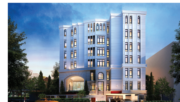
Launched The 8 Collection and Rich Park Terminal Laksi Station