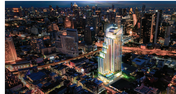
Launched The Rich Park Triple Station and The Rich Ploenchit - Nana