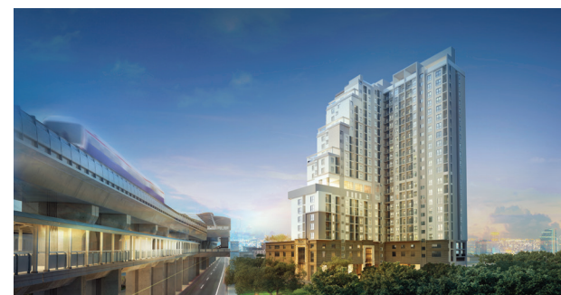
The company entered the stock exchange on August 2014 with a registered capital of 714 million baht Launched The Rich Ville Ratchapruek and The Rich Sathorn - Taksin