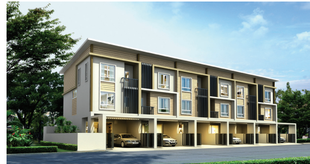
Launched The Rich Biz Home and Rich Park Chaophraya