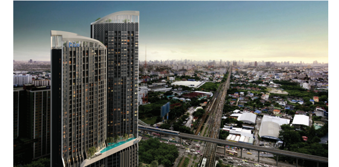
Launched The Rich Rama 9 Srinakarin Triple Station Branding The Rich