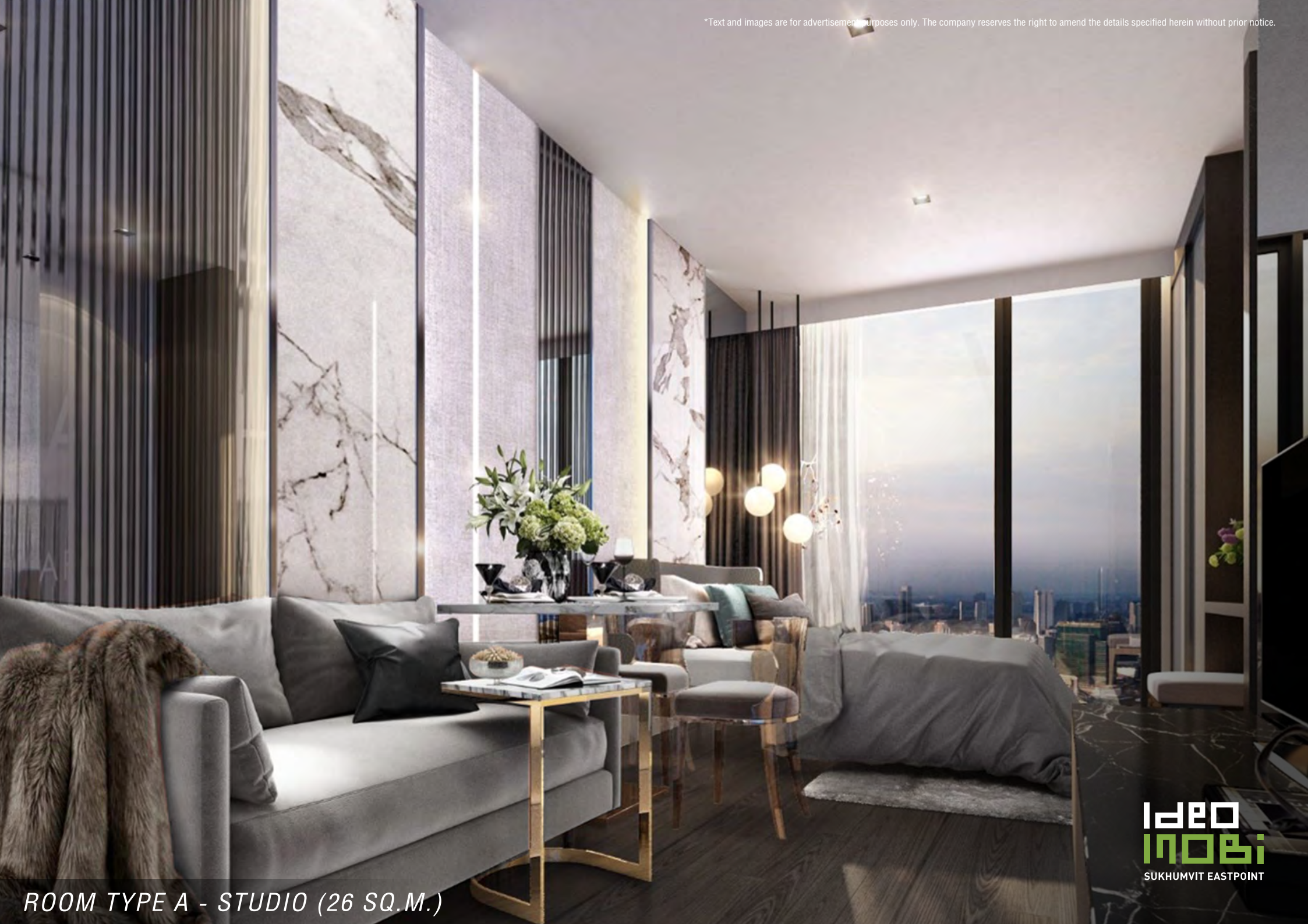
ROOM TYPE A - STUDIO (26 SQ.M.)