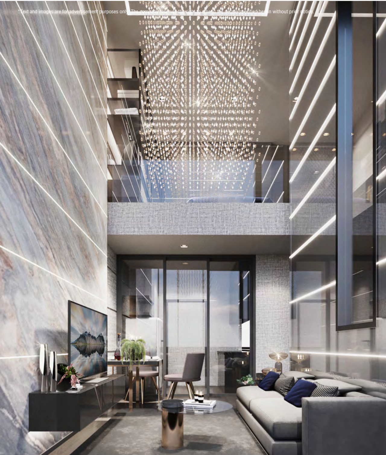
ROOM TYPE E - DUPLEX (50 SQ.M.)

*Text and images are for advertisement purposes only. The company reserves the right to amend the details specified herein without prior notice.