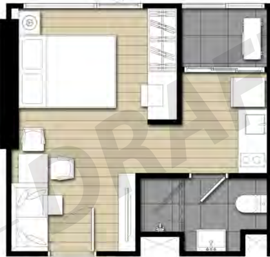
STUDIO 26 SQ.M.