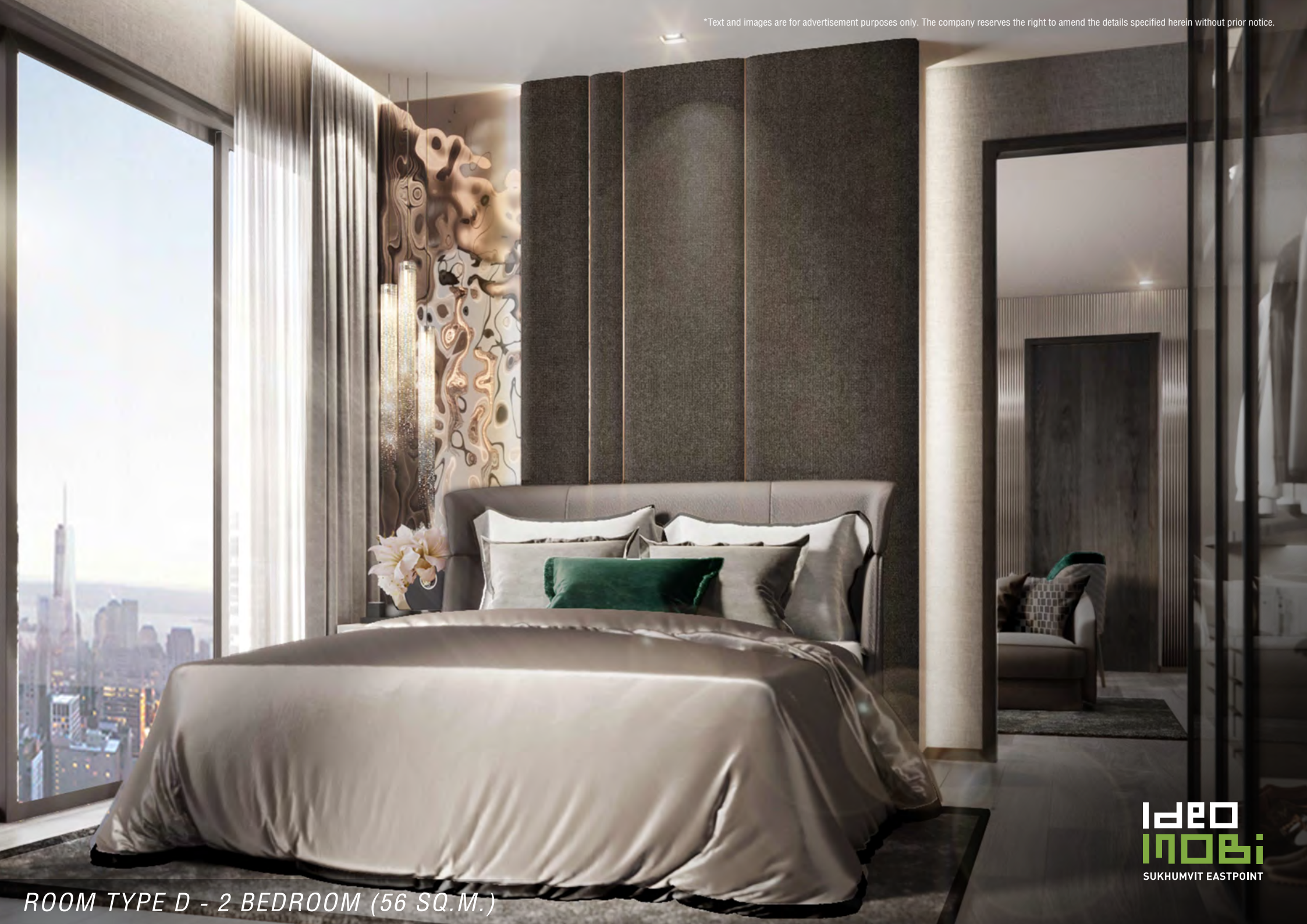
ROOM TYPE D - 2 BEDROOM (56 SQ.M.)