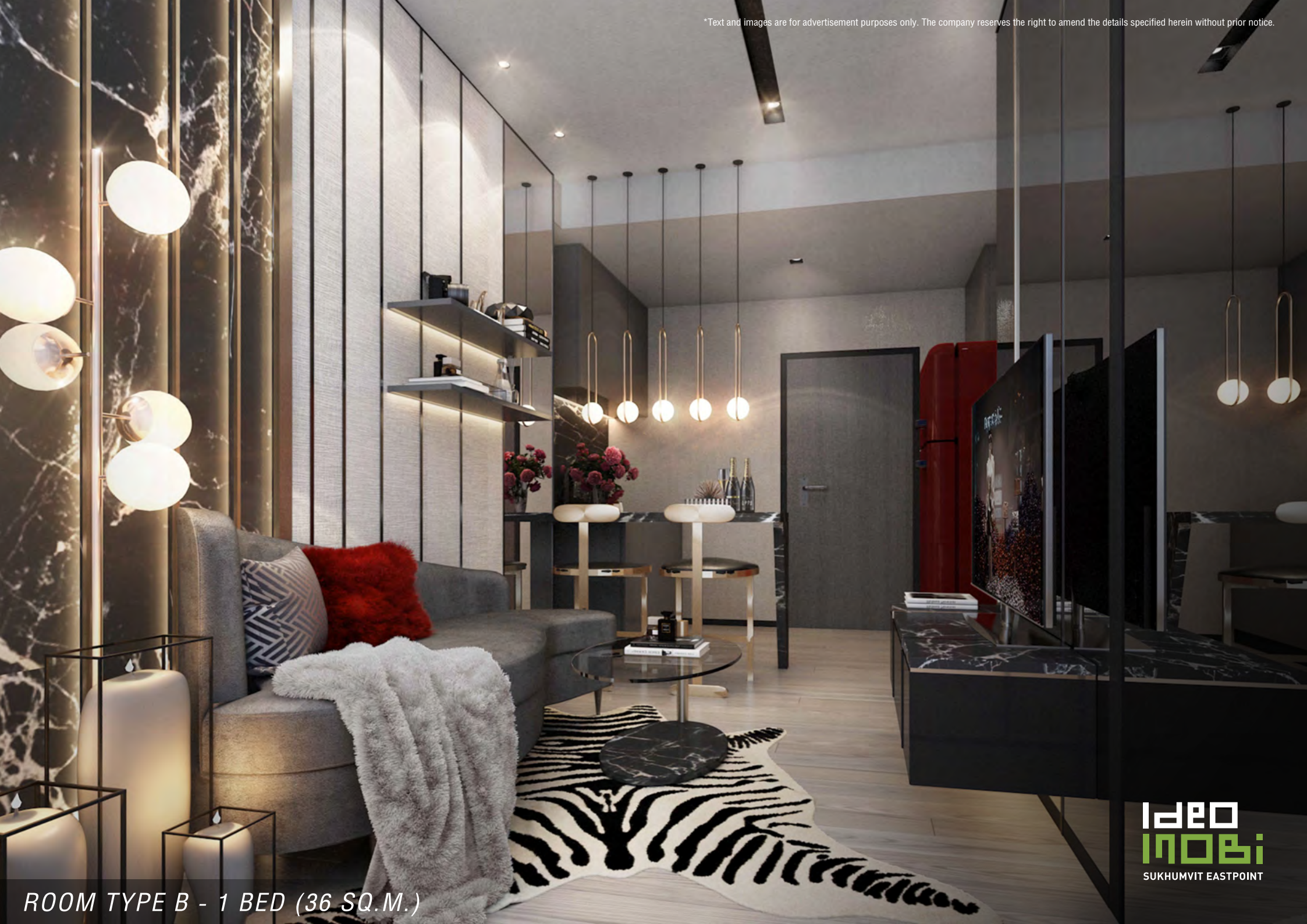
ROOM TYPE B - 1 BED (36 SQ.M.)