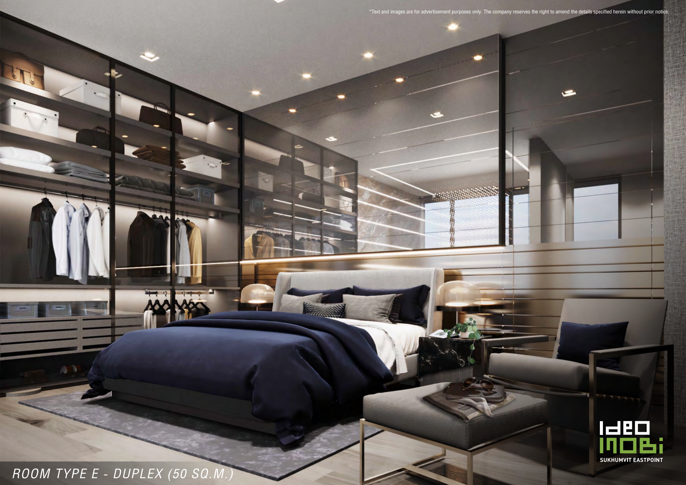
ROOM TYPE E - DUPLEX (50 SQ.M.)