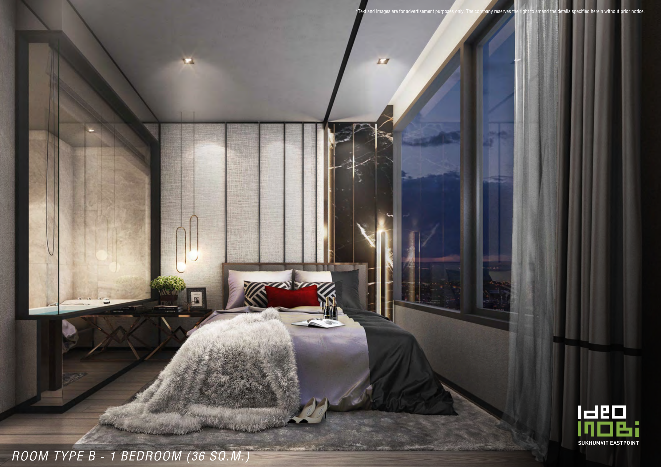
ROOM TYPE B - 1 BEDROOM (36 SQ.M.)